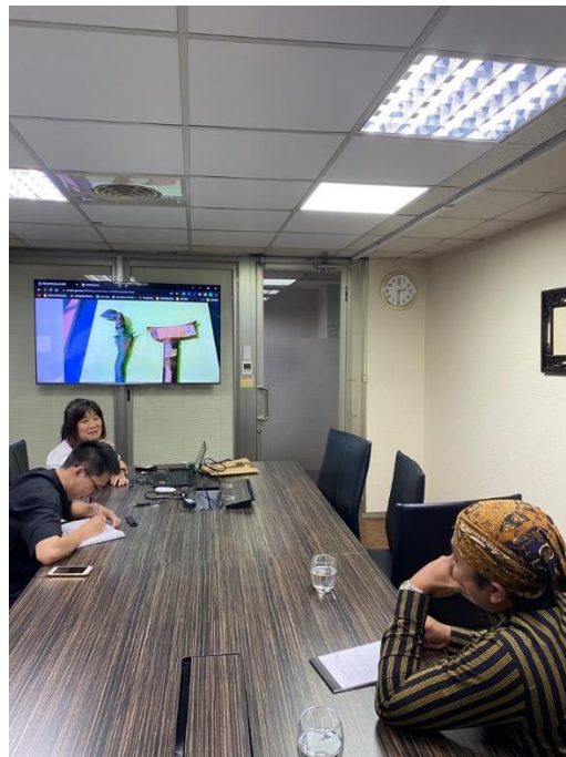
Gambar 6. Kegiatan sebagai narasumber dalam mengklasifikasikan tentang jenis-jenis Keris, Dhapur , Pamor , dan Tangguh yang terdapat di National Taiwan Museum