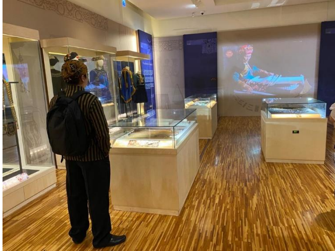
Gambar 7. Observasi peninggalan seni budaya masyarakat Suku Aborigin Taiwan koleksi National Taiwan museum