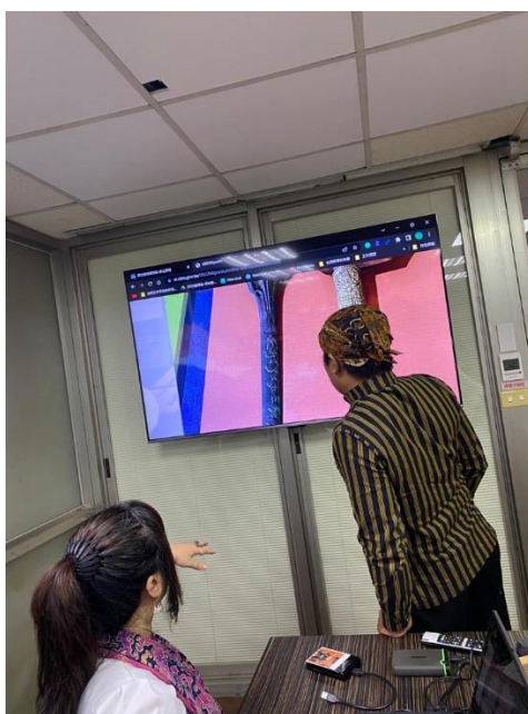
Gambar 4. Kegiatan sebagai narasumber dalam mengklasifikasikan tentang jenis-jenis Keris, Dhapur , Pamor , dan Tangguh yang terdapat di National Taiwan Museum